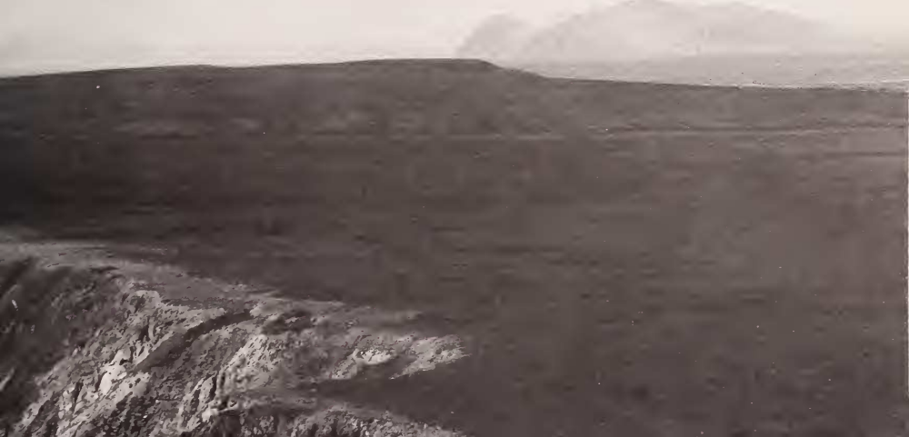
Fig. 8. Fellfield tundra atop Cape Peirce, 21 August 1976.

The intertidal zone along more exposed shores includes a variety of substrate types, including sand, fine gravel, coarse gravel, cobble, boulder, and solid rock strand and cliff. The marine portion of the study area is underlain by the continental shelf and is fairly shallow. Along the